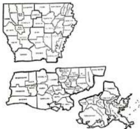
Figure 3.2 I - New Orleans/Bayou-River Health System Area II - Mid-Louisiana Health System Area III - North Louisiana Health System Area

C. Section 1536 of the Health Planning and Development Act was modified in 1981 by Congress to permit governors to request that mandated health planning functions be conducted at the state level only. In December, 1981, the Secretary of the Department of Health and Human Services recognized Louisiana as a "1536 state," which effected the dismantling of the Health Systems Agency (HSA) Network in the state. Effective March 31, 1982, the Mid-Louisiana HSA ceased external operation, followed by the closure of the New Orleans/Bayou-River HSA and the North Louisiana HSA on April 30, 1982.